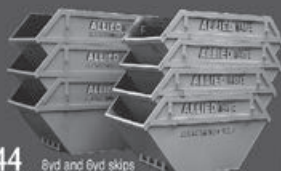
6yd and 8yd skips